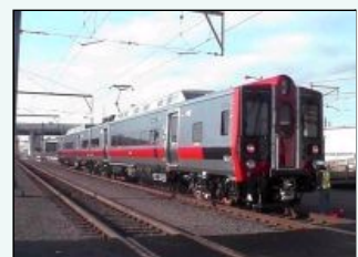
New railroad cars make test run