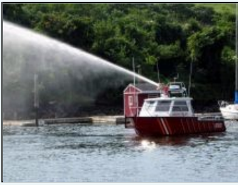
From TVs to SUVs, state spends anti-terror funds

Investigators excavated the property in September 2007 and removed several vehicles, as well