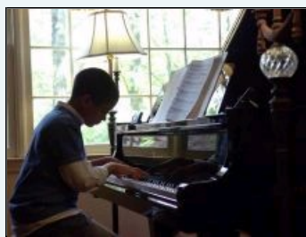
Young Stamford pianist holds benefit concert for his elementary school