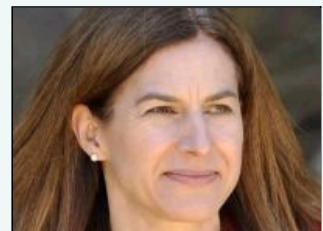
High court rules Bysiewicz unqualified for Atty Gen.