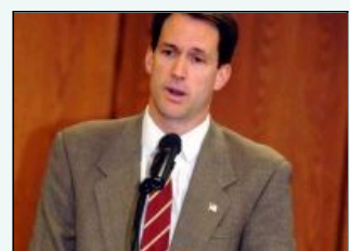
Himes exposes flaw in petty cash system