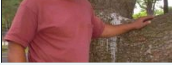
Parks and recreation employee files human rights claim against town